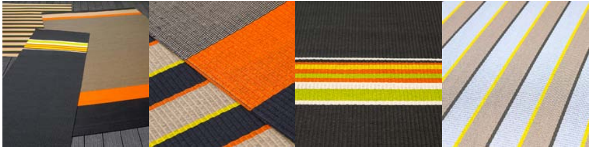
1st photo: from front to back Butterfly, Panorama, Tropic

Prices for carpets start from 198 €/m 2 .